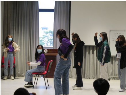
Students form their own script, act on their own to produce a drama performance at the end of the retreat