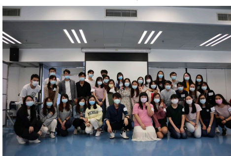
Group photo of participants of HCAMP Kick-Off event