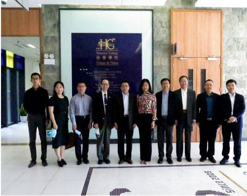
Group photo at the HC Lobby