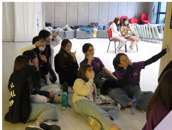
Participants taking selfies together after the HC Retreat