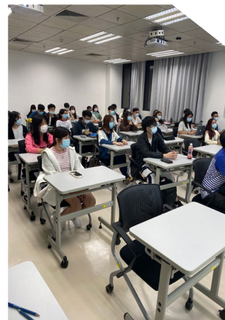
The student listening carefully to the speakers during the HC Alumni Sharing