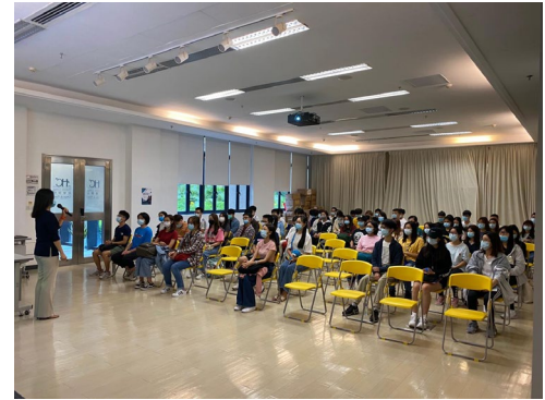
The audience concentrating on the talk about the current situation of global economics and the pandemic