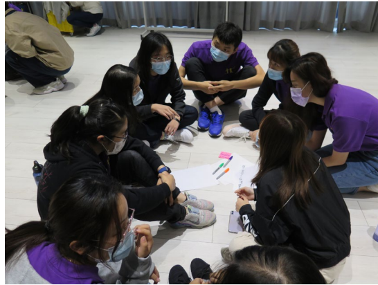
The participants of the HC Retreat forming a discussion circle

HC Retreat is an event aiming to bond the new HC members together to deepen their rapport with their classmates