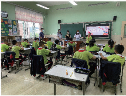
SPC and HC students conducting voluntary teaching in Shanxi Bo Ai School (山西博愛學校)