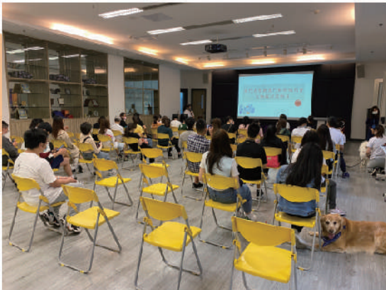
A sharing about Animal-assisted therapy and the duties of animal doctors by Macau Animal Welfare Association

“Willing to devote” is some of the main missions of HCSA. The HCSA organizes Community Service Activities every semester to strengthen students' commitment and care at large.