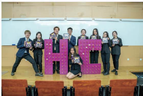
Thank you for your hard work and contribution to HC in the past year!

New board members of HCSA are elected through a list of outstanding candidates every year in November or December.