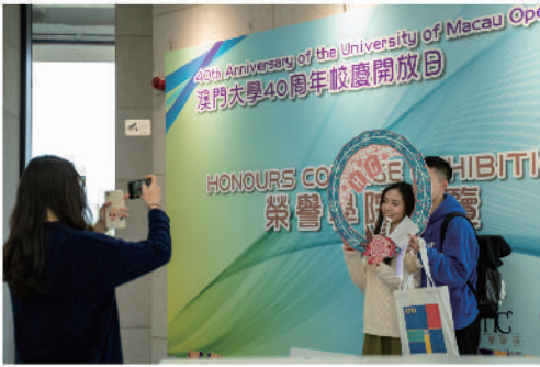
Participants taking photo at the HC Exhibition backdrop