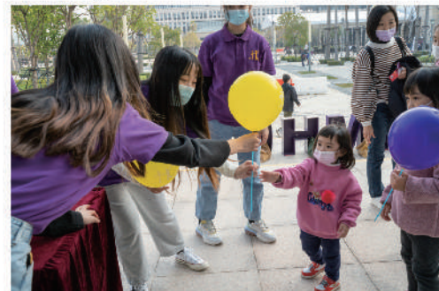
Many parents joining UM Open Day with their children

UM Open day is an annual major event of the university. HC introduces the programme, study plan and career development to the students and public through a series of sharing and photo exhibition.