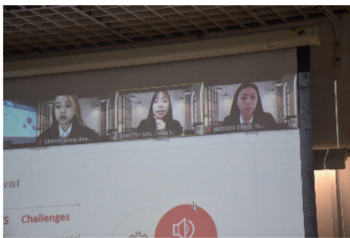
International students conducting the presentation by Zoom