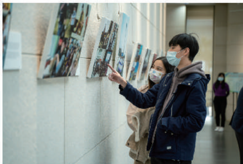
Participants interested in the photos shown at the Photo Exhibition