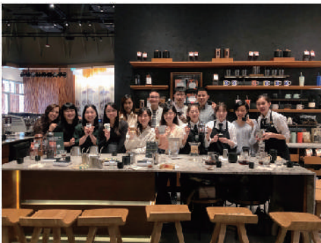
HC alumni and students having a good time learning how to make a perfect cup of coffee