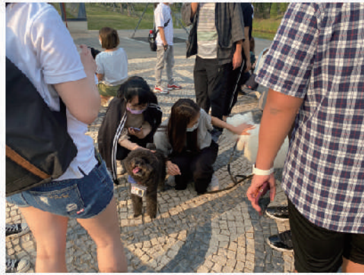
The “Dogtor”, animal doctors of Animal-assisted therapy

“Willing to devote” is some of the main missions of HCSA. The HCSA organizes Community Service Activities every semester to strengthen students' commitment and care at large.