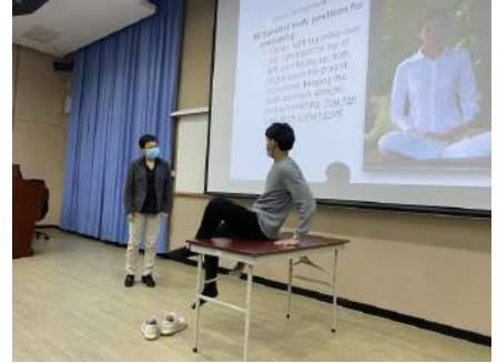
Practicing meditation with the participants

News Discussion Forum is an activity held every semester organized by HCSA. Respectable professors from our University are invited to be the guests of the forum.