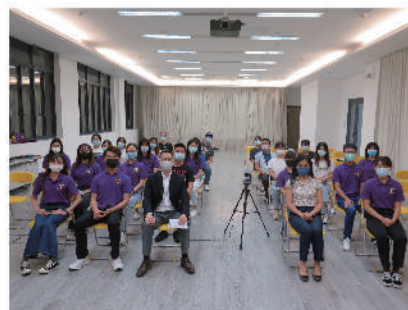
Group photo taken after the Honours Forum