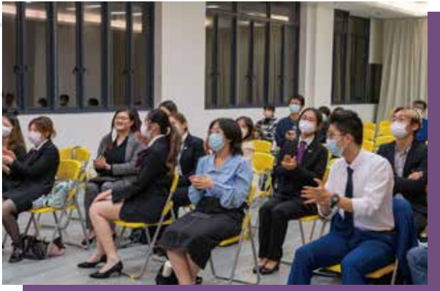
//Voters paying attention to candidates' sharing