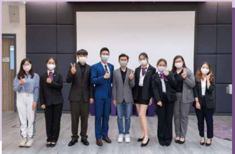
The newly elected HCSA Board Members of AY2022/2023//