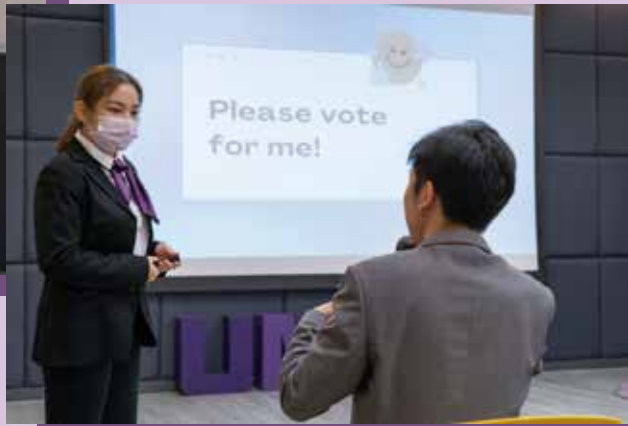
//Candidates introducing themselves and presenting their goals and visions