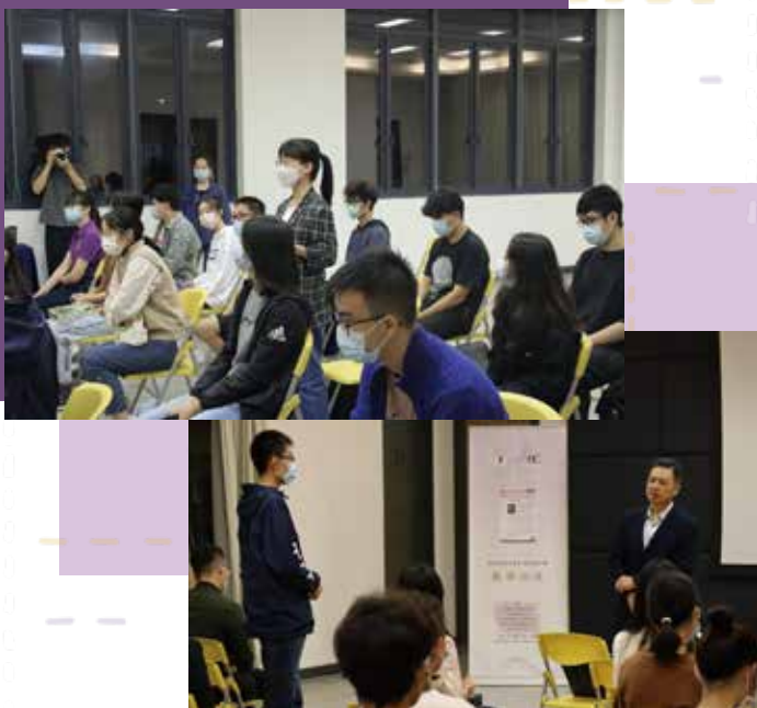
//Students very interested in the sharing