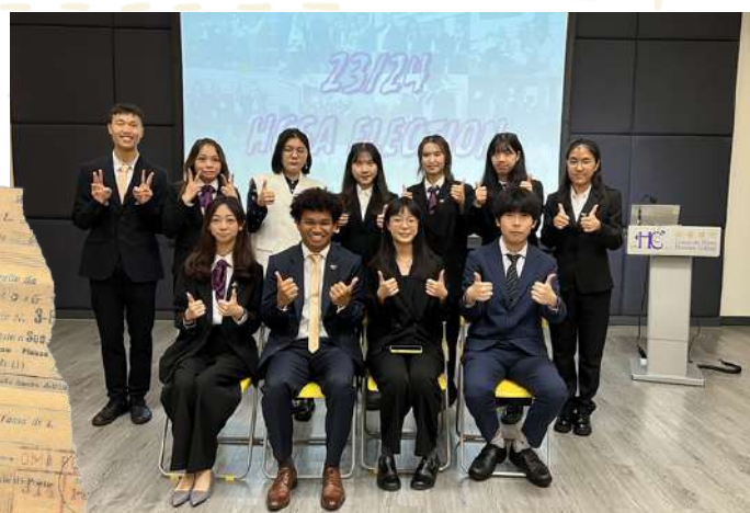
New batch of HCSA for academic year 2023/2024