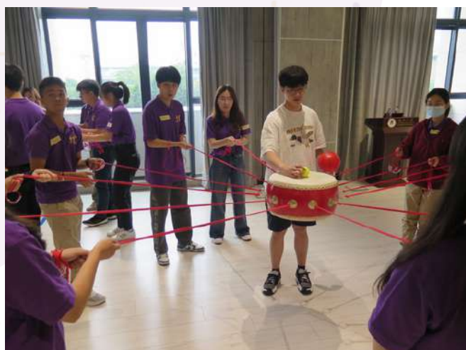
Students playing Ice-breaking games