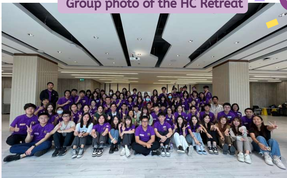
Group photo of the HC Retreat