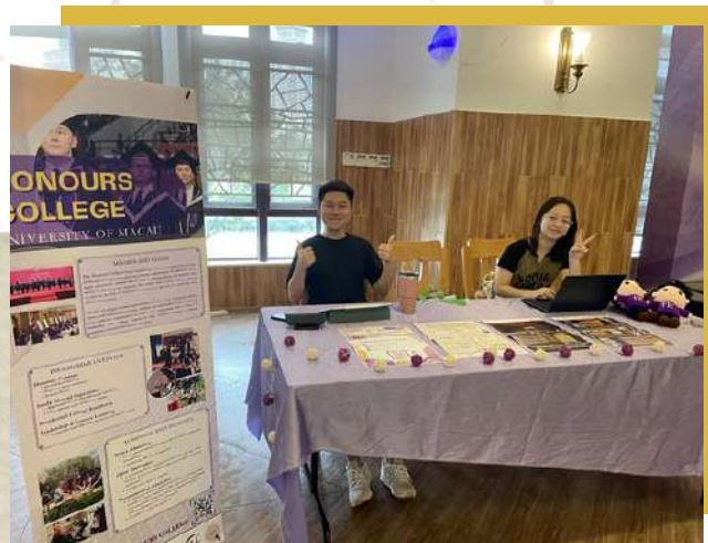
HCSA booths in different RCs to promote HC