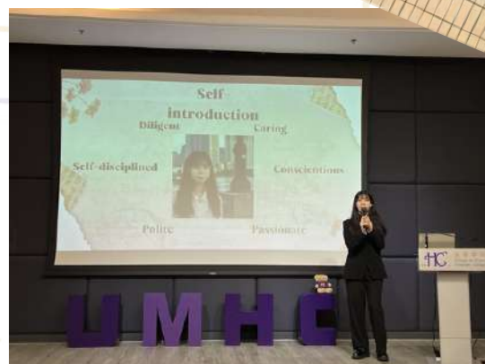
Candidates introducing themselves and presenting their goals and visions