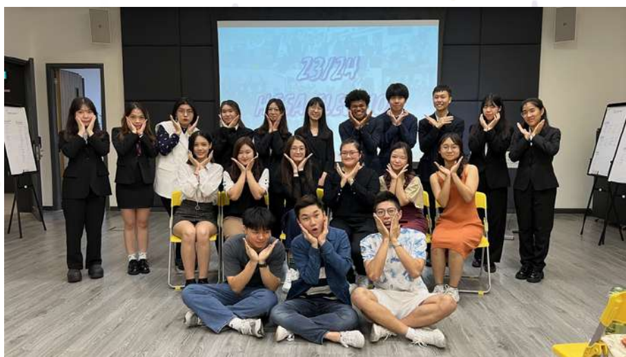
New and old batch of HCSA