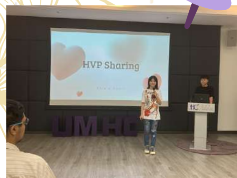
Sharing by the volunteers