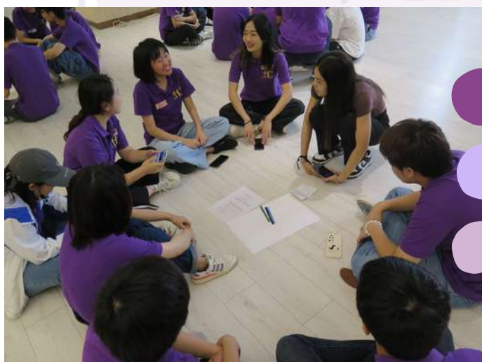
Students preparing for the drama performance