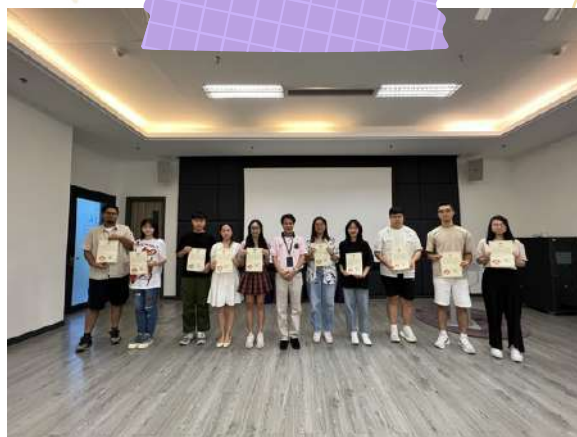
HC students who joined the HVP Programme being awarded certificates