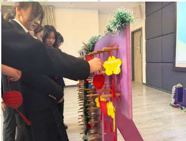
Students writing down their wishes on the "Ema" boards